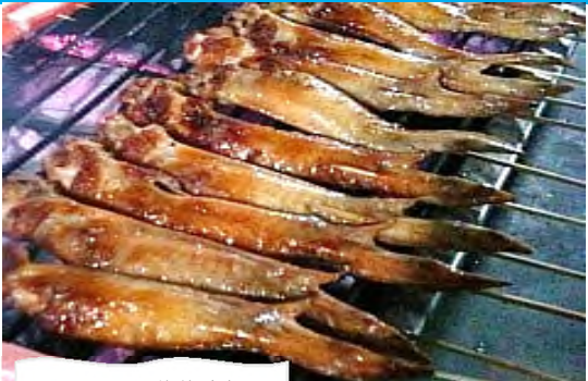
BBQ Dinner - 烧烤晚餐