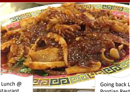
Going back Lunch @ Pontian Restaurant