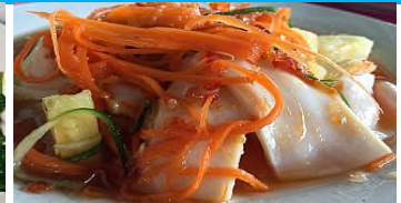
家乡菜午餐- Home Cooked Lunch