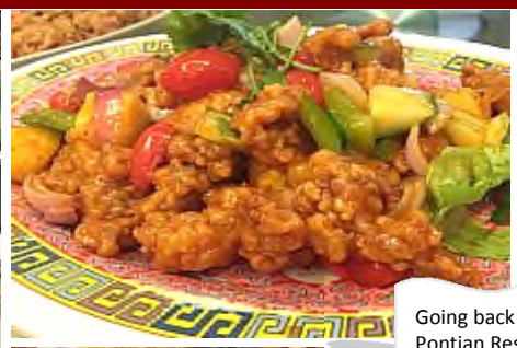
Going back Lunch @ Pontian Restaurant