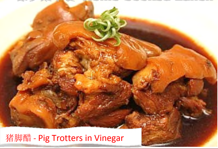
猪脚醋 - Pig Trotters in Vinegar