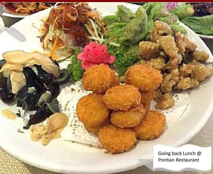
Going back Lunch @ Pontian Restaurant