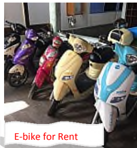
E-bike for Rent