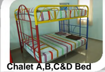
Chalet A,B,C&D Bed