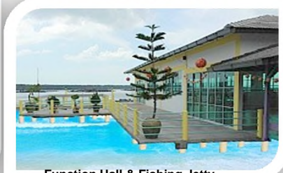
Function Hall & Fishing Jetty