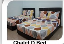
Chalet D Bed